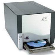
Rimage Everest III