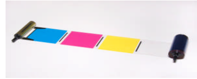
VersaMax with “Primer” Layer

Unlike Photo or Color Ribbons, VersaMax adds the proprietary adhesive panel (Primer) to the 3 existing CMY panels. The adhesive panel makes it possible to print on the widest range of discs available.