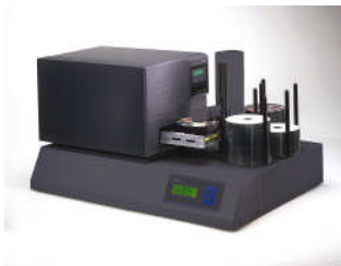
TEAC AL220 USB Disc Autoloader System