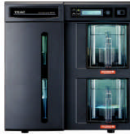
TEAC AP-55 Discathlon 2 Autoloader System