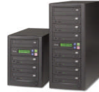
TEAC CD and DVD Duplicators