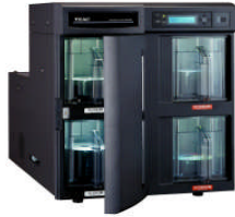
TEAC WP-55 Explorer I Disc Publishing System

TEAC offers a complete line of Printers, Duplicators, Autoloaders and Autopublishers: