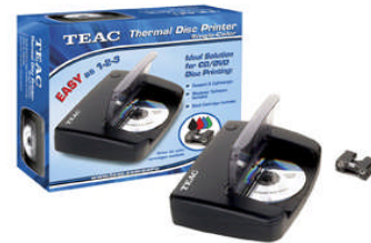
TEAC P-11 Thermal Disc Printer

For more products, please visit TEAC web site at www.TEAC.com/DSPD